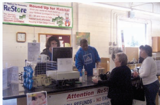
Volunteers help customers at the San Diego ReStore, a 17,000 square foot facility with many products for the home.

Stop by and take a look at the great deals at 10222 San Diego Mission Road in Mission Valley, or visit us online at www.sdhfh.org . Be sure to visit us on March 19th for our huge Spring Sale - every department will be discounted up to 70%! ↗