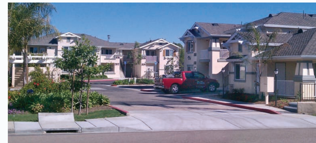
The new Carlsbad condominium community of Roosevelt Gardens

With the help of our generous sponsors, volunteers, the City of Carlsbad, wonderful supporters like you and our hardworking Habitat partner families, SDHFH has recently completed the Carlsbad condominium community of Roosevelt Gardens, creating 11 affordable homes for local families in need.