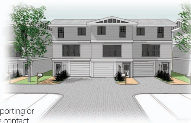
Escondido's Elm Street 16-unit community development